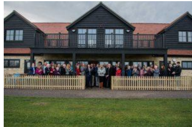
The Potential Future World