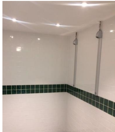
Showers and toilets