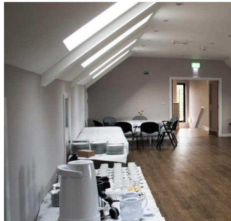
Upstairs Bar Area