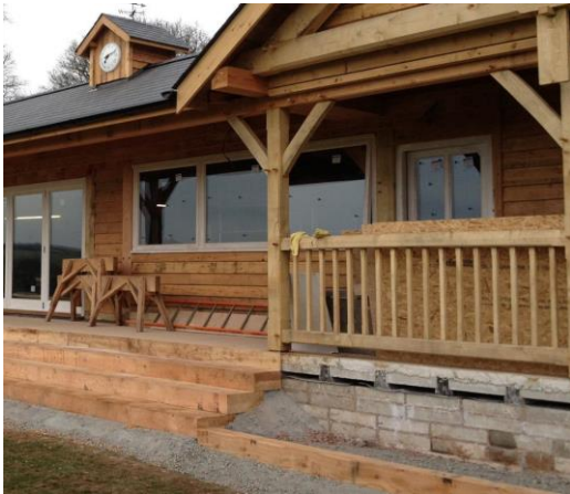
Wood finish to the pavilion